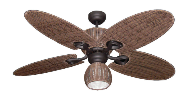
MHF134OB (w/ MHLKOB)